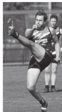
2nd Grade Leading Goalkicker