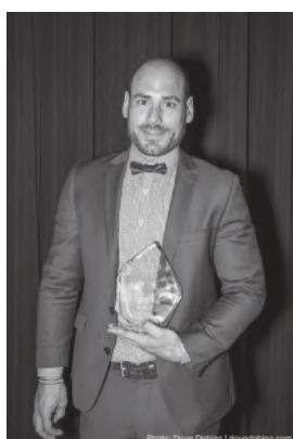
Coach of the Year