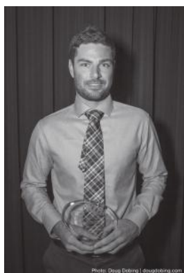
1st Grade Leading Goalkicker