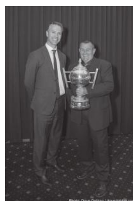
2015 Club Championship