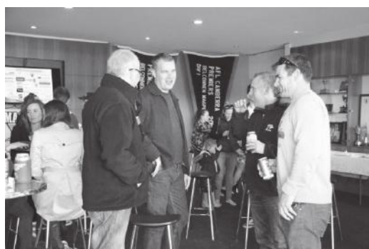
100 Game Dinner